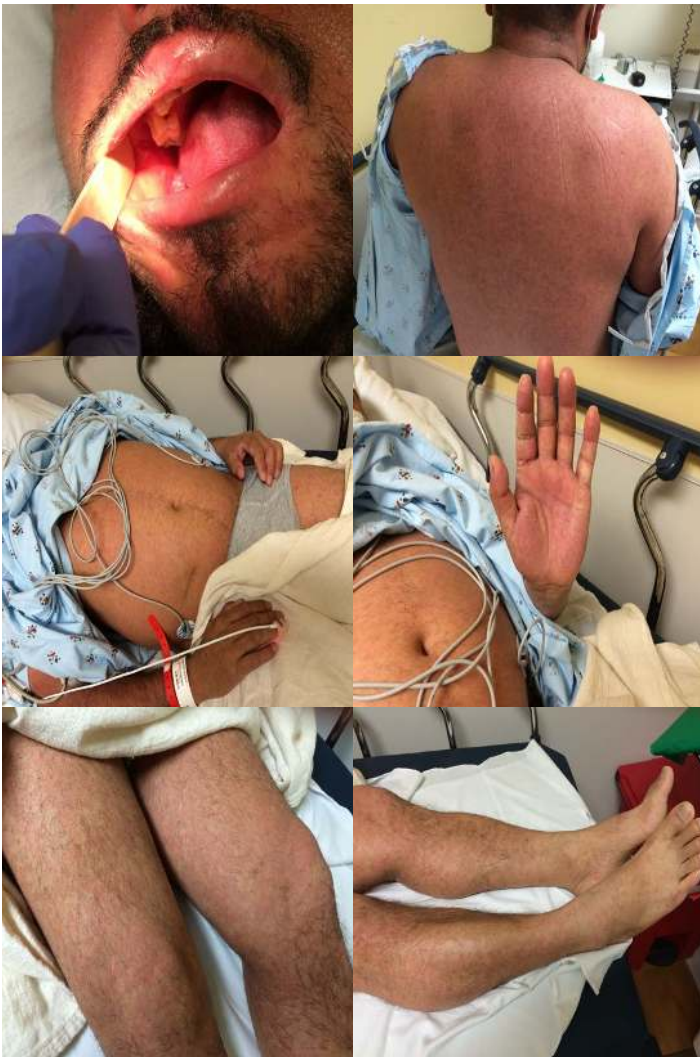
Figure 4. Measles rash and Koplik spots in an adult male.

age. A prodrome of fever, headache, abdominal pain and myalgias can be subclinical. In these atypical presentations, the rash can be macular, vesicular, petechial, or urticarial and can begin on the hands and feet and spread centripetally. When atypical measles was first reported in the late 1960s and early 1970s, it was often mistaken for Rocky Mountain Spotted Fever.