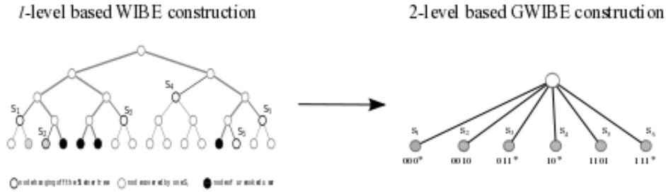
Fig. 3. From l -level WIBE based construction to 2-level GWIBE based construction.