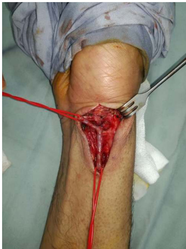
Figure 4 End-to-end anastomosis of the distal radial artery.