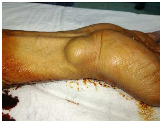
Figure 1 Right wrist swelling.

On patient request and taking into account the potential risks such as thromboembolic complications or even rupture, a surgical repair was decided and performed. Under local anesthesia, a 4 cm longitudinal incision above the aneurysm was done. A saccular aneurysm was identified at the distal part of the radial artery after the takeoff of the superficial palmar arch branch (Figure 3). Then, the proximal, the distal radial artery, and the origin of the superficial palmar arch were controlled. Excision of the aneurysm was done, and the excised specimen was sent for histopathology. Arterial continuity was restored by primary end-to-end anastomosis between proximal and distal radial artery (Figure 4). The postoperative course was uneventful, and patient was discharged on the same day on simple analgesia. The histopathology report showed a dilated arterial sac with intraluminal mural thrombus.