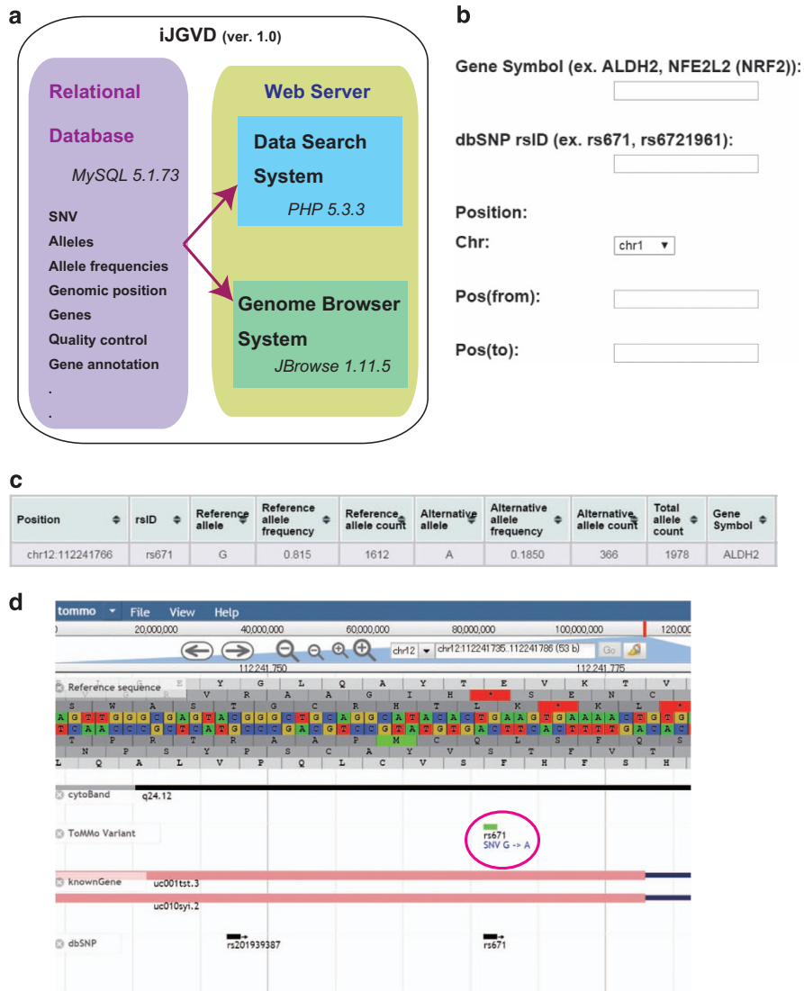
Figure 1. Schema of the systems and graphical user interfaces of iJGVD. (a) Schematic diagram of the iJGVD systems. (b–d) Graphical user interfaces for iJGVD. (b) SNV searches are initiated at the top page by specifying a gene, dbSNP ID, or genomic region. (c) SNV allele frequencies are displayed in a table, and rs671 is shown as an example. (d) A graphical view of the SNV location in the genome browser. iJGVD, integrative Japanese Genome Variation Database ; dbSNP, database single nucleotide polymorphism; SNV, single nucleotide variant.