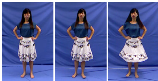
Figure 2: Frames where models have the same pose but different motions.

In principle, the body shape of the model should match that of the user for the superimposed garment to fit well. Since this is generally not the case, image warping [Jain et al. 2010] could be applied to the database videos according to an estimate of the user’s body shape [Weiss et al. 2011]. For simplicity, we assume here that body shape of the user and model are about the same, and leave body