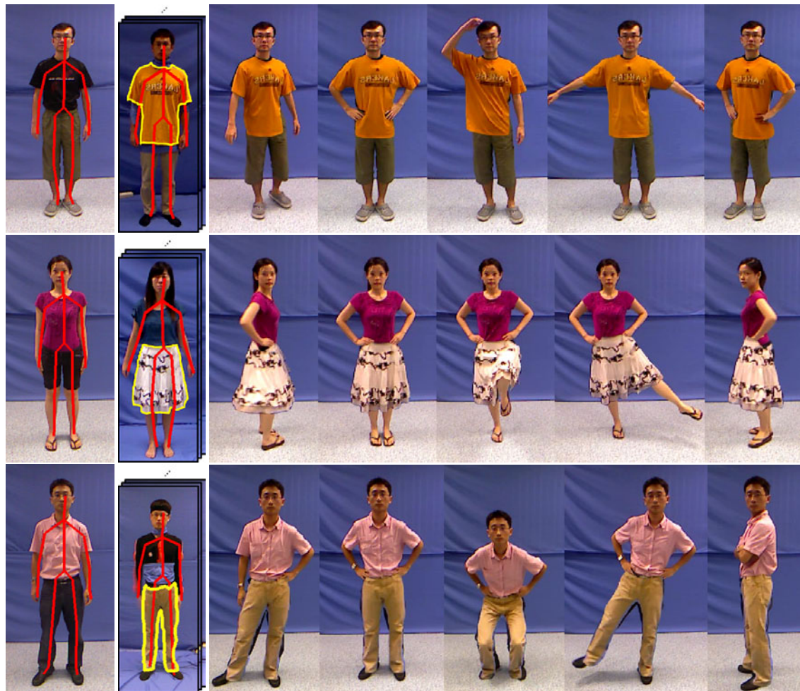
Figure 4: From left to right are an input video frame, the corresponding segmented garment from the database, and sample output frames.