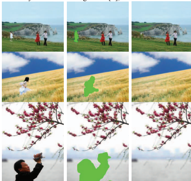
Figure 1: Inpainting results of propose algorithm

selects the local best patch to inpaint the target patch, while our algorithm selects a small set of patches and inpaints the target patch based on a linear combination of them. So our algorithm is less greedy for not selecting a local optimal patch, more efficient to reduce the SSD error to ensure visually plausibility for using a linear combination, and will not suffer the blurring of image for L1 norm constraint encourages the sparsity of the linear combination, i.e. the L1 norm reduces the number of patches selected. Based on all the merits and supporting experimental results, it can be shown that general sparse representation based algorithm proposed works better on image inpainting better than texture synthesis based algorithm[6], which is the state of art.