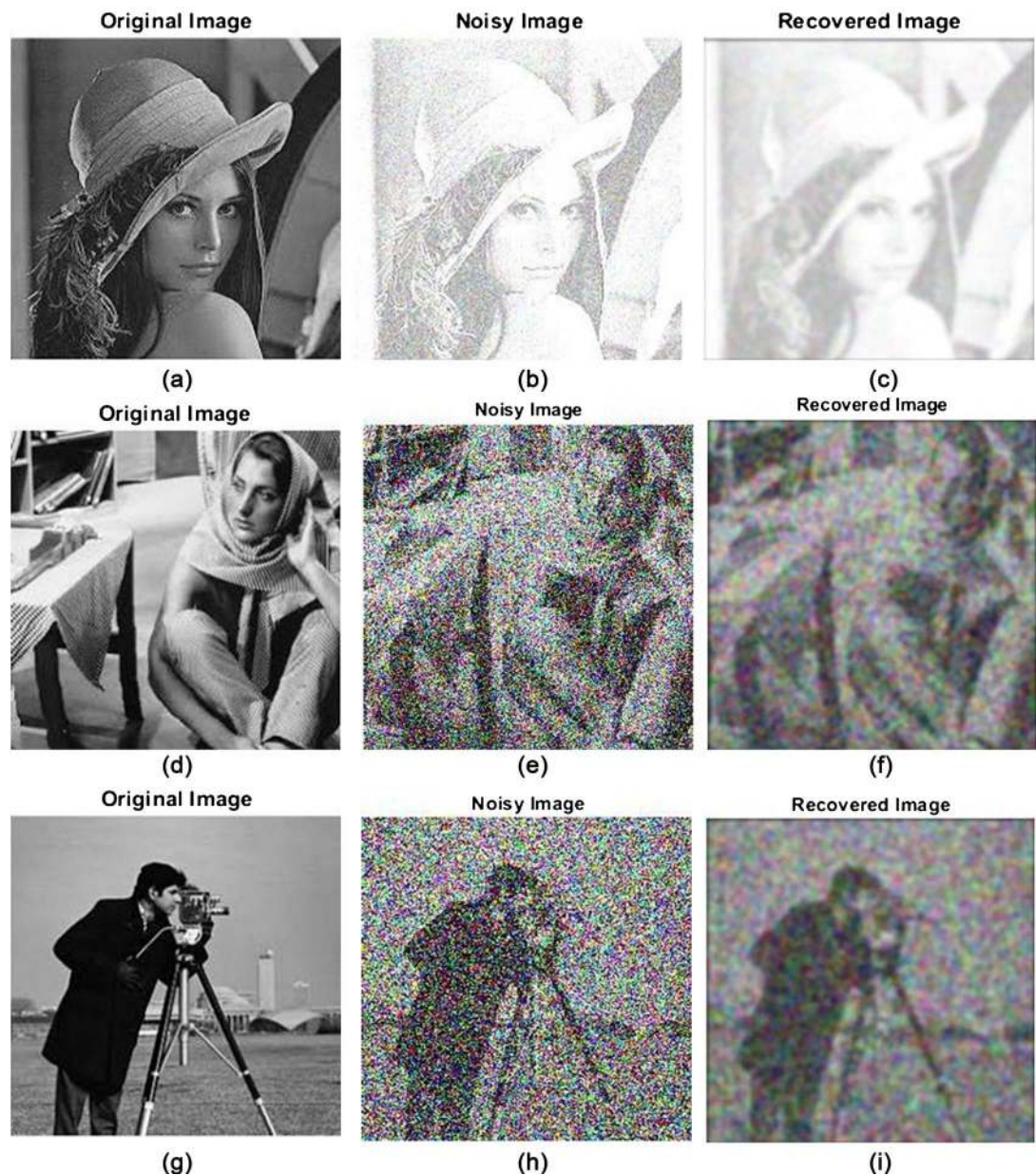
Figure 3. ((a), (d), (g)) are three bench mark original images; ((b), (e), (h)) are the corresponding noisy images with noise variance 0.6; ((c), (f), (i)) are the corresponding denoised images Here, the noise level is 0.6. The MSE, PSNR, SSIM and FSIM value of two images (the original and the recovered image) are listed in Table 1 .

recovery quality of output image is also deteriorating.