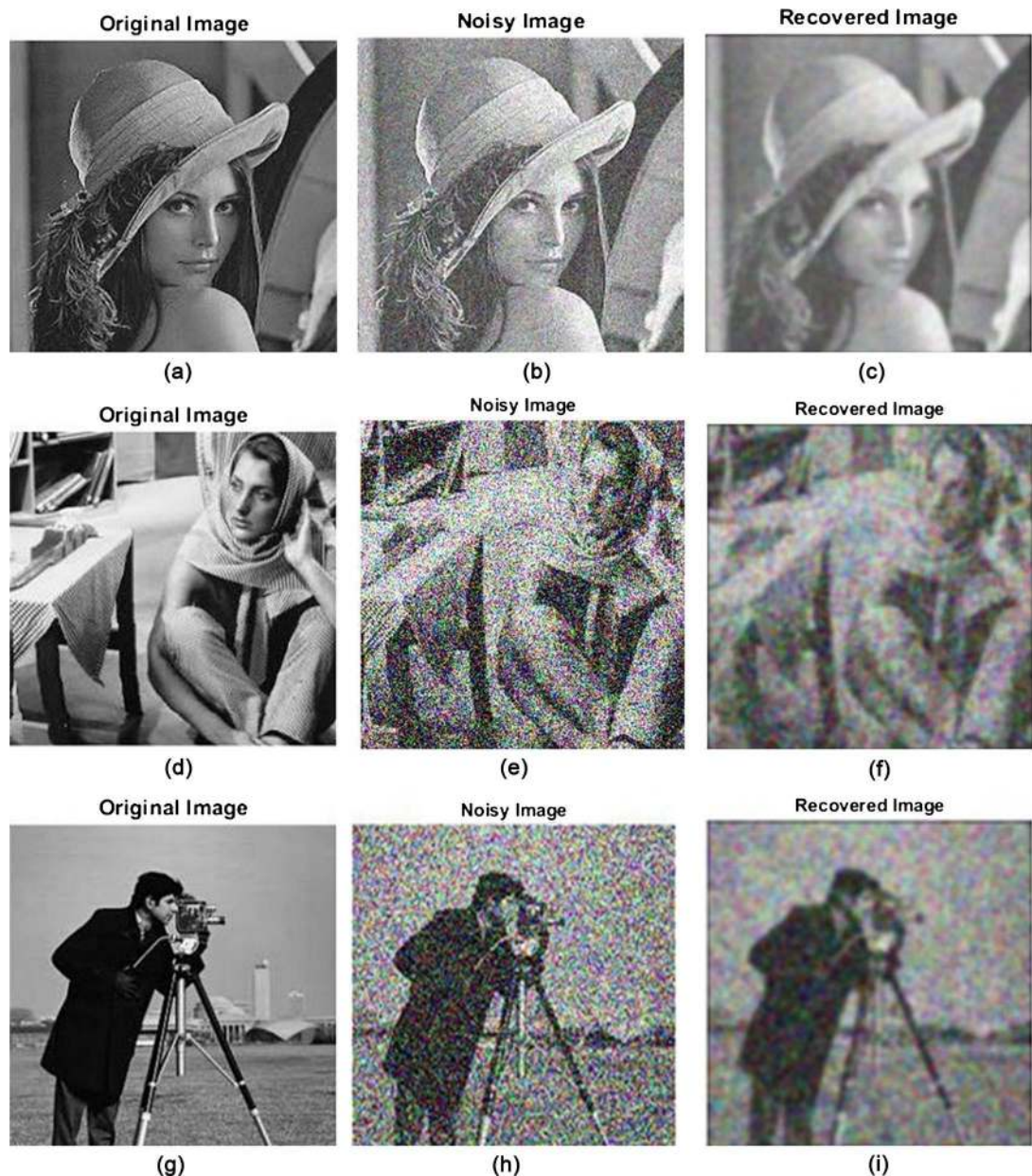
Figure 1. ((a), (d), (g)) are three bench mark original images; ((b), (e), (h)) are the corresponding noisy images with noise variance 0.2; ((c), (f), (i)) are the corresponding denoised images. Here, the noise level is 0.4. The MSE, PSNR, SSIM and FSIM value of two images (the original and the recovered image) are listed in Table 1 .

We used three benchmark images (Lena, Barbara, Cameraman) and then used Gaussian noise of different concentrations (noise variances). For all noise variances the mean is taken as 1.0. Then we applied Gaussian convolutional mask for denoising. The original, noisy and denoised images are shown in Figure 1 , Figure 2 and Figure 3 for noise variances 0.2, 0.4 and 0.6, respectively.