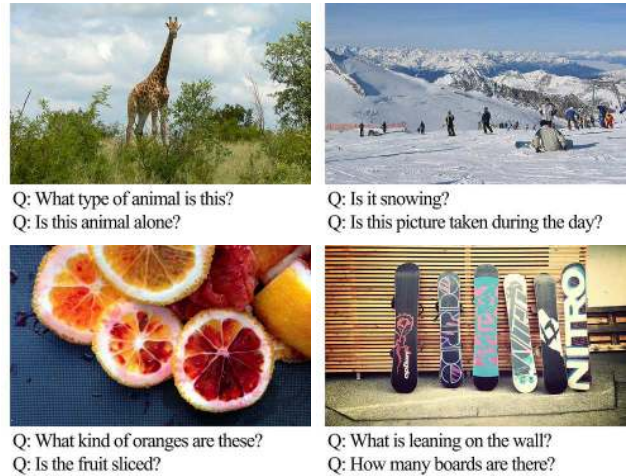
Figure 1. Sample images and questions in VQA dataset [1]. Each question requires different type and/or level of understanding of the corresponding input image to find correct answers.

One of the ultimate goals in computer vision is holistic scene understanding [30], which requires a system to capture various kinds of information such as objects, actions, events, scene, atmosphere, and their relations in many different levels of semantics. Although significant progress on various recognition tasks [5, 8, 21, 24, 26, 27, 31] has been made in recent years, these works focus only on solving relatively simple recognition problems in controlled settings, where each dataset consists of concepts with similar level of understanding (e.g. object, scene, bird species, face identity, action, texture etc.). There have been less efforts made on solving various recognition problems simultaneously, which is more complex and realistic, even though this is a crucial step toward holistic scene understanding.