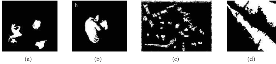
Figure 3: Foreground markers (objects).