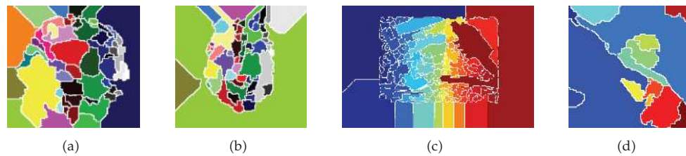
Figure 6: Standard watershed segmentation on the gradient images of Figure 1.