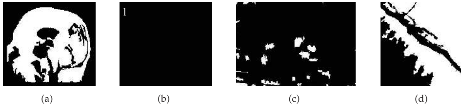
Figure 4: Background objects.

In this paper, we used simple algorithm to create foreground and background markers using morphological image reconstructions. We used erosion-based gray-scale reconstruction (3.3) and (3.4) followed by dilation-based gray-scale reconstruction (3.1) and (3.2) to trace the foreground objects (selecting structuring element as per the desired objects). The results are shown in Figure 2 .