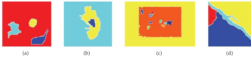
Figure 5: Final segmented images.