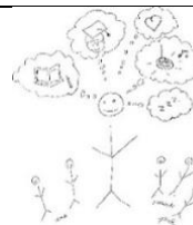
b. timeline, multiple spaces, non-scholarly body