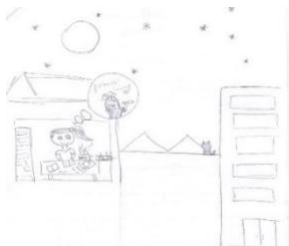
c. timeline, double space, non-scholarly body