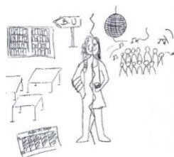
d. present time, multiple spaces, non-scholarly body