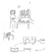
d. present time, multiple spaces, mixed body