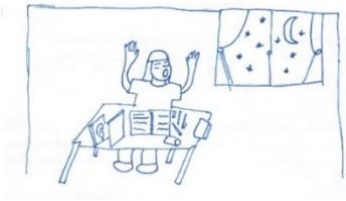
a. present time, single space, scholarly body