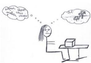
c. present, multiple space, scholarly body