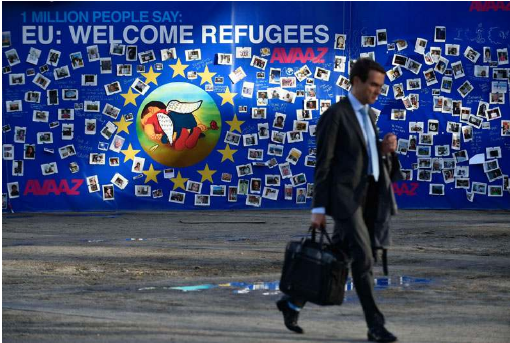
Figure 2. The Wall of Welcome at the Schuman Roundabout square in Brussels, in front of the EU headquarters, 14 September 2015.