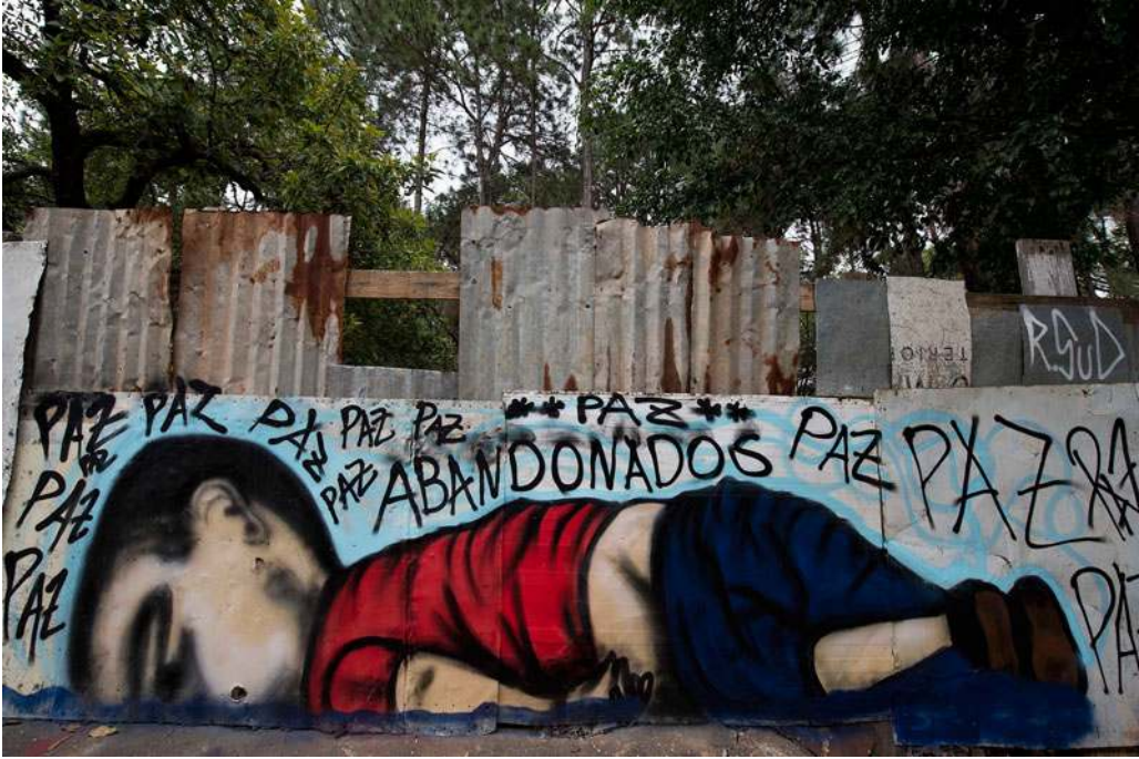
Figure 1. A mural in Sorocaba, ninety kilometres from Sao Paulo, Brazil, 6 September 2015.

of context, in the form of an angel or sleeping in a child's bedroom. 71 It is worth noting though that those less overtly political mediations were in some cases applied to make explicitly critical-political statements. For example, the global civic society organisation Avaaz used the frequently circulated motif of Alan Kurdi as an angel in a Wall of Welcome located right in front of the European Union headquarters in Brussels (Figure 2). Thus while these remediations of 'Kurdi' can be separated into different analytical categories, for example those that decontextualise or recontextualise the figure of Alan Kurdi when the photographs were circulated, seen and (re)used we see a process of emotional bundling as mediations are connected across those analytical categories. 72