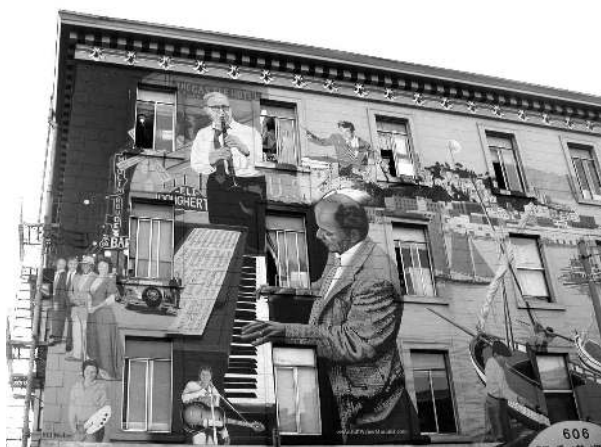
Fig 6. Jazz mural, 1987, by Bill Weber, Broadway-Columbus St., San Francisco

For their scale, color, symbolic meaning and – in some cases – high artistic values, murals work as expressive landmarks in urban space and help to better construct “cognitive maps”. Considering murals as clearly visual dominants, the function of identification could be regarded as a typical formal issue as well. Pragmatic values of mural painting do not exclude the artistic and aesthetical values. The most important aspects of themes represented in paint – regarded as a formal issue – submit the typology of architectural motives, figural scenes, decorative or “environmental” flora and fauna pictures, “quotations” from famous historical paintings. Figural depicting is one of the most frequent and oldest narrative motives. In ancient Egypt, Rome and Mesopotamia the figurative wall painting illusions were widespread, and especially enormous “superhuman scale” depicting