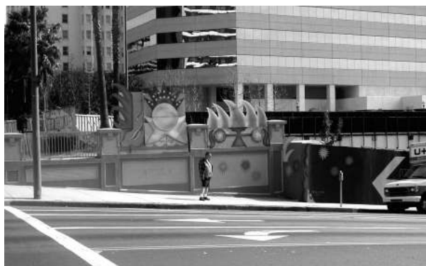
Fig 7. Painted fence, Long Beach, 2005

was believed to have extraordinary or even magic power. Monumental portraits probably could activate an old myth of “enlivening by picture”, functioning since prehistoric man began to create his first drawings on the walls of caves. Anyway, the symbolic expressions of powerful paintings equal in scale with architecture, also impress spectators today. In countries behind “the Iron Curtain” that kind of depicting, especially huge portraits of Lenin in the former Soviet Union and of Ceaucescu in Romania, were made very often and were typical of the so-realistic style. In contemporary murals, gigantic-size portraits often turn the attention of viewers to ordinary people, members of society and not previously noticed by their neighbors.