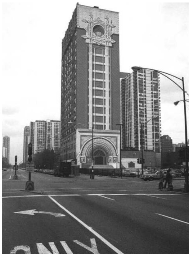
Fig 1. Homage to the Chicago School of Architecture , Richard Haas, Chicago, North La Salle, 1980, source: V. Barthelmeh, Murschilderingen , Meulenhoff, Landshoff, Amsterdam, 1982

Since mural painting always exists within an architectural context and represents in fact a specific form of architectural color, it could never be perceived as absolutely autonomic art. Basic formal issues expose the interrelation between architecture and painting, like domination, subordination or harmonization, stressing deformation and interference in the tectonics of a setting, including change of scale, change of horizon, deformation of vertical direction, illusion of space, and illusion of architectural ornament [4] (Fig 1).