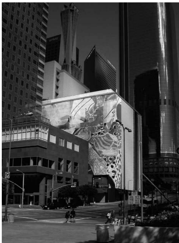
Fig 2. Dusk , 1991, designed by Frank Stella, Los Angeles, 433 Olive St. / Pershing Square

On the other hand, in addition to decorative and formal values, murals usually carry a message and introduce new values to architecture; so to say, they go beyond the architectural frame. Murals open before the audience “new worlds” and “spaces”; they act on their imagination, and “enliven” performances. There is continuity in the history of traditional mural forms from pastiches of Egyptian, Greek, Roman, and Renaissance murals, through pastoral scenes based on the eighteenth-century European gardens or oriental landscapes, to fantasy scenes and faux paint effects. From another point of view, a wide spectrum of mural works also proves that architectural painting mirrors contemporary art