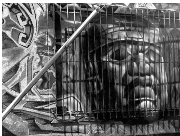
Fig 5. Mural in Mexican district, San Francisco, 2006

people's life from the past. Such images might play a significant educational role. On the other hand, lots of giant pictures have quite a different mood, not always so serious. Building size jokes, optical illusions or just desire of mere decoration and “beautiful look” serve visual entertainment in urban and architectural space (Figs 6, 7). We can find the exemplification of such kind of creativity in almost all historical periods. The importance of its meaning is again appreciated and stressed. The characteristic trends of the second half of the 20 th -century architecture turn towards tradition manifesting itself in historicism, homeliness and regionalism as well as humanization of spatial environment with popular tendencies as one of aspects. Charles Jencks mentions the idea of “the pursuit of humor” [7] as one of the main stylistic values of post-modern architecture, and according to this author, “enjoyment” constitutes the third defining criterion of postmodernism [8].