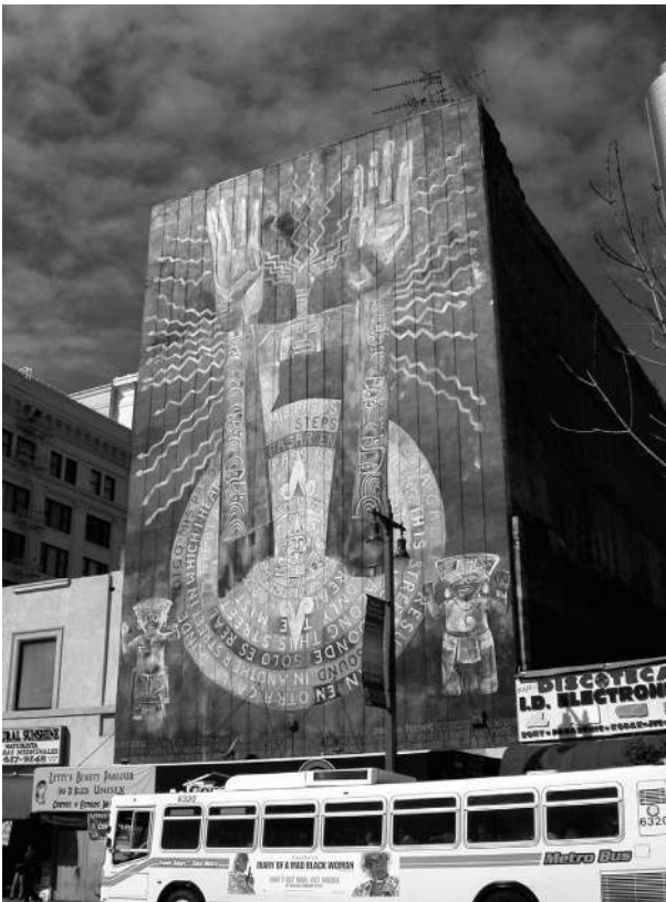
Fig 4. Street of Eternity , 1993, by Johanna Poething, Los Angeles

pe and composition. Another problem is the choice of technique of presentation.