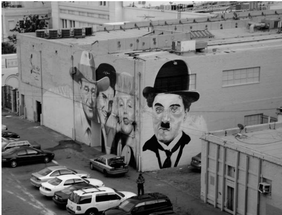
Fig 9. John, Elvis, Marilyn and Charlie , Franklin Avenue, Hollywood, Los Angeles

hood. Monumental portraits of well-known personalities and figures-symbols of pop-culture are also very popular (Fig 9). The heroes of comics Superman , Batman and King Kong compete with heroes from the action movies or cinema stars.