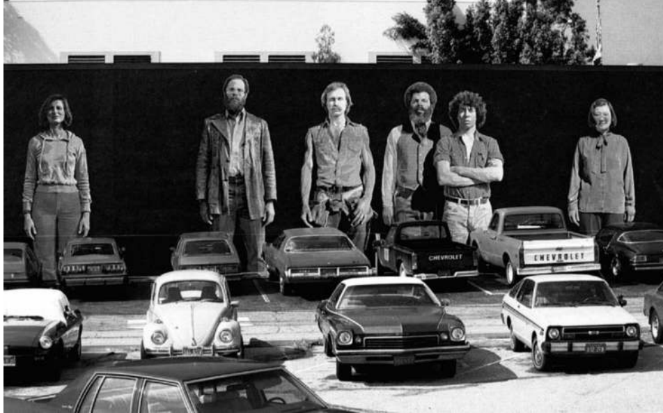
Fig 8. Six L.A. Artists , 1979, by Kent Twitchell, Torrance/ California, Engracia Ave., source: V. Barthelmeh, Murschilderingen , Meulenhoff, Landshoff, Amsterdam, 1982