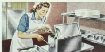
U-S-S STAINLESS STEEL assures cleanliness and economy in hospitals, food plants, schools, laundries.

The U-S-S trade-mark shown above is one of a family of U-S-S trade-marks. Some say "Premier Spring Wire" or "Vitrenamel" or just plain "Steel" . . . but all have the big letters U-S-S prominently displayed. Whenever you see these letters U-S-S—the trade-mark of United States Steel—you know the steel is good.