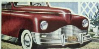
U-S-S STAINLESS STEEL is the lasting decorative metal . . . for everything from automobiles to watches.