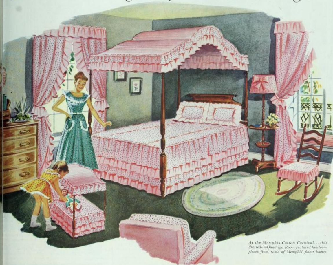
At the Memphis Cotton Carnival... this dressed-in-Quadriga Room featured heirloom pieces from some of Memphis' finest homes.

Decorator's Quiz: What is the cotton you can live with without a Qu alm? That fits all your schemes, from Qu aint-to-Contemporary? That you can flounce, or ruffle, or tailor, or Qu ilt? That you can mix and match, in prints and plain colors from Qu iet-to-Bold? That sun won't fade, and water won't Qu ench? And that costs so little you can buy Qu antities . . . without exceeding your Qu ota? Right! It's Quadriga Cloth