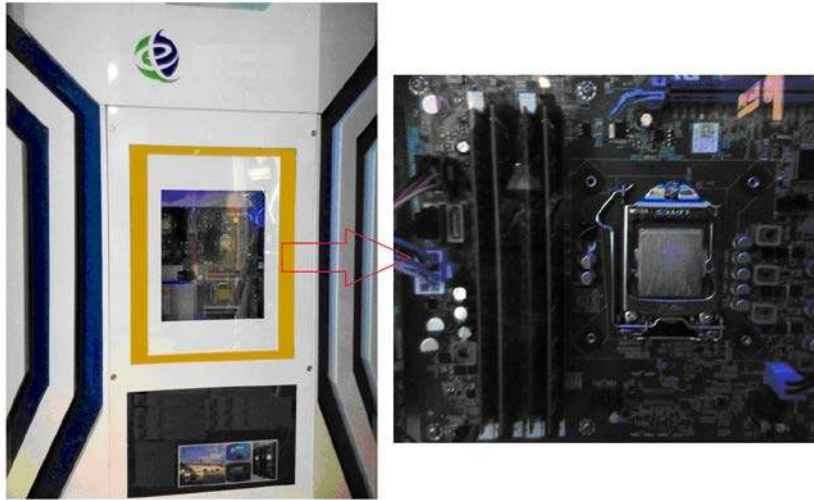
Figure3. Photos of Immersion Server Cluster