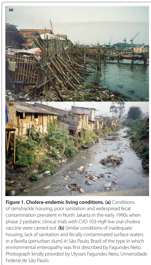
Figure 1. Cholera-endemic living conditions. (a) Conditions of ramshackle housing, poor sanitation and widespread fecal contamination prevalent in North Jakarta in the early 1990s when phase 2 pediatric clinical trials with CVD 103-HgR live oral cholera vaccine were carried out. (b) Similar conditions of inadequate housing, lack of sanitation and fecally contaminated surface waters in a favela (periurban slum) in São Paulo, Brazil of the type in which environmental enteropathy was first described by Fagundes Neto.

small intestine. It is also possible that some individuals may have baseline intestinal immunity not reflected by an elevated serum vibriocidal titer.