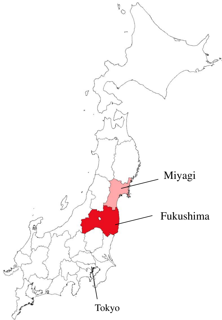
Figure 1 Map of east Japan