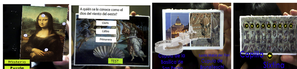
Fig. 1. Italian renaissance art images augmented with information, questions and 3D objects.

The qualitative data was collected looking for quality components of usability: learnability, efficiency, errors and satisfaction identified by Jakob Nielsen (Nielsen, 2003).