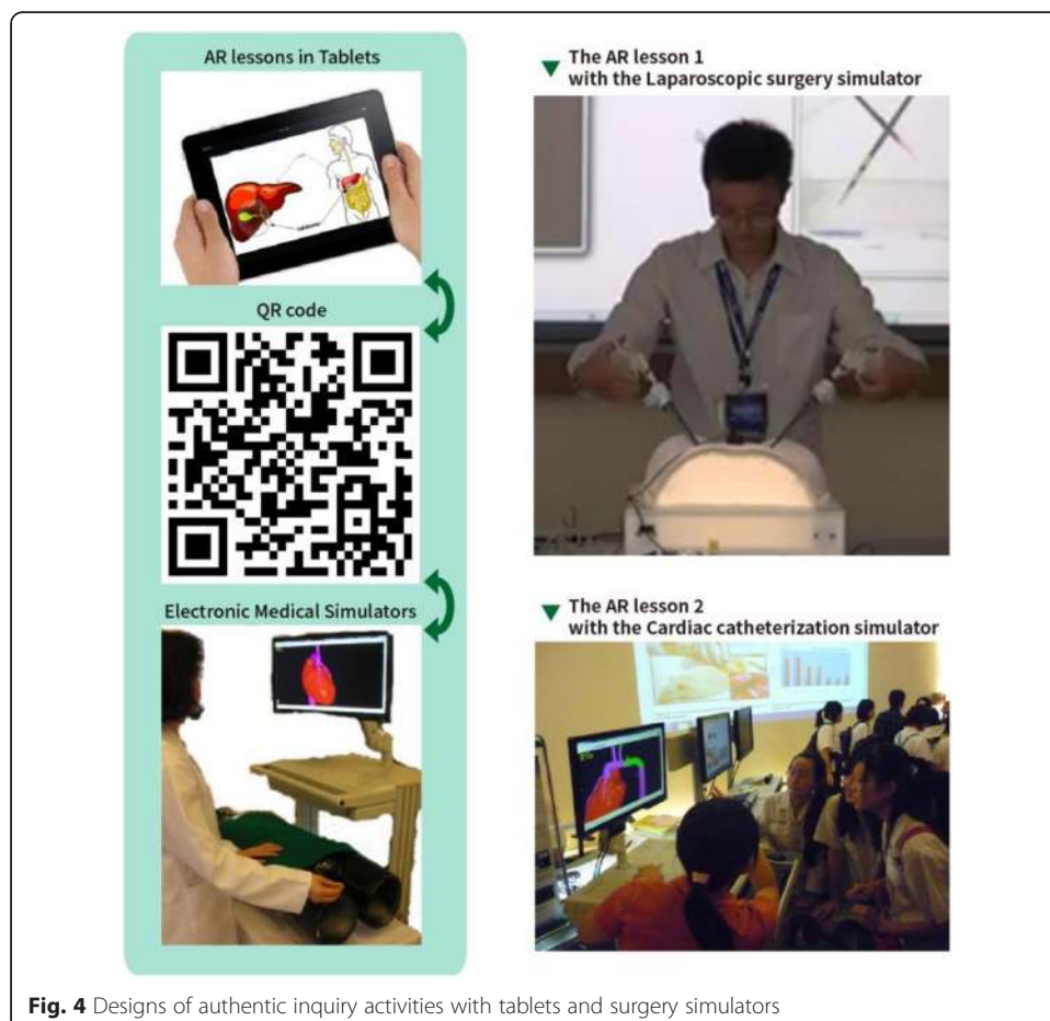
Fig. 4 Designs of authentic inquiry activities with tablets and surgery simulators

For the laparoscopic surgery lesson, the students were told that they were to role-play surgery interns. Each group of students worked with a tablet and the simulator. First, a video clip on the tablet showed a patient describing his symptoms, and the students were required to diagnose the possible disease after checking the X-ray images. Second, some surgery options were shown to the students from which they were required to select the most appropriate procedure for treating the disease. Third, the students used the scanning function to activate the simulator and operated the