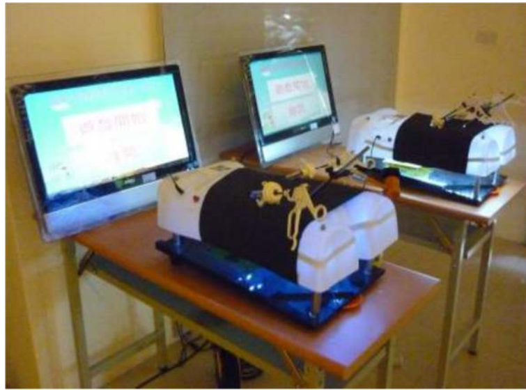
Fig. 2 Laparoscopic surgery simulator

were designed to integrate innovative technologies in medical electronics and aimed to nurture the students' STEM interest.