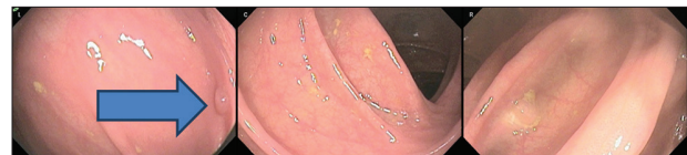
Figure 2 Example of potentially omitted adenoma on left screen

preparation. If the operator considered the preparation to be poor (BBPS<7), the patient was not included. Patients underwent conscious sedation with propofol or general anesthesia with oral intubation. All procedures were performed with a Fuse® adult standard video-colonoscopy (168 cm working length, 12.8 mm scope outer diameter, 3.8 mm working channel). CO 2 insufflation was used. Colonoscopies were performed by 6 senior operators and 5 fellows under direct supervision. Colonic polyps were resected during the procedure if necessary. Polyps were removed if they were identified as other than diminutive (1-2 mm) rectal polyps thought to be hyperplastic in nature. The removal techniques included polypectomy with diathermic forceps or cold snare, and endoscopic mucosal resection.