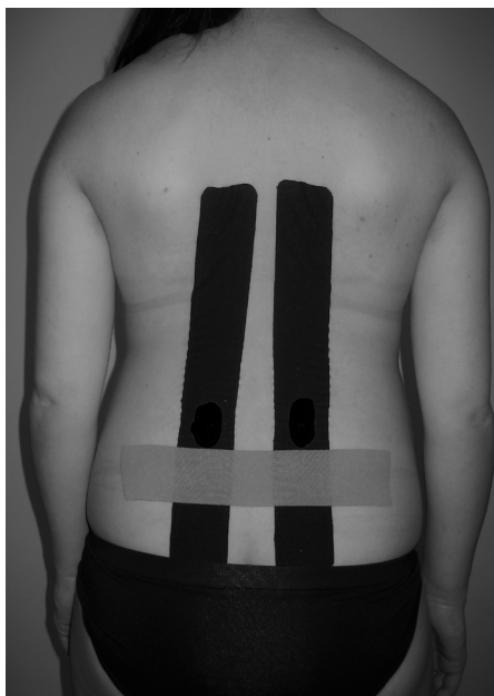
Figure 1. Kinesio Tex Gold applied on the lumbosacral area

Elastic tapes were applied in areas with the greatest mobility of the thoracolumbar fascia relative to muscles below (Fig. 1).