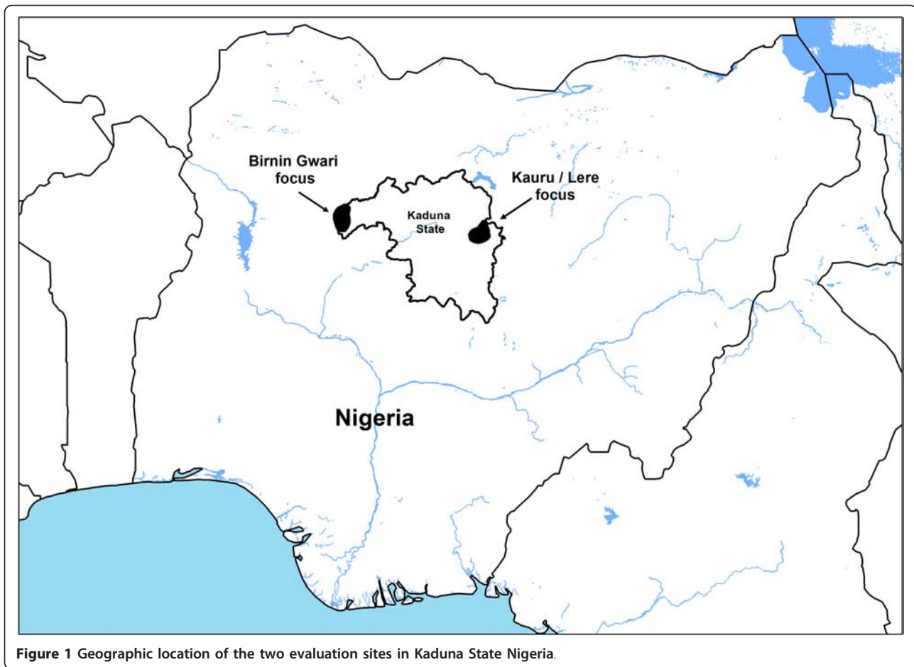
Figure 1 Geographic location of the two evaluation sites in Kaduna State Nigeria.

are located along the rivers of Mairiga and Kwingi in Birnin Gwari and Galma and Karami in Kauru and Lere. The two foci were selected for the following reasons: i) communities in these foci had pre-control epidemiological data; among the areas where large-scale ivermectin treatment was first introduced in Africa were these two foci in Kaduna in which treatment of a sample of the population started as part of a randomised controlled trial of ivermectin in 1988 and 1989, and where skin-snip surveys had been done in preparation for the trial [6,17]. ii) the foci included hyper-endemic villages, i.e. villages with a prevalence of microfilaridermia > 60% [15-17]; iii) the area was located along a river with known breeding sites of Simulium damnosum s.l. , iv) the communities had had 15 - 17 years of annual treatment with ivermectin using the community-based programme since 1991, and subsequently through the community-directed treatment with ivermectin (CDTI) strategy from 1997 with more than 65% treatment coverage.