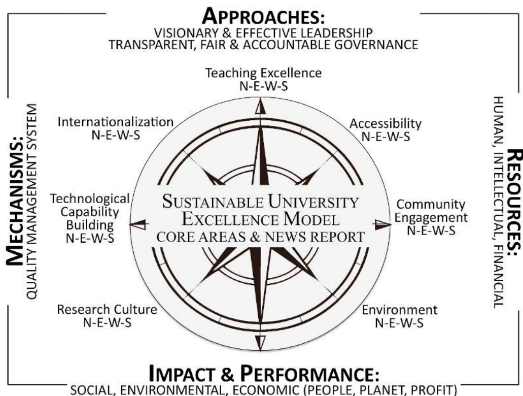
Figure 1. Sustainable University Excellence Model.

The selection of the symbols N-E-W-S is highly intentional in that these connote to the four primary directions on a compass (North, East, West and South) that when arranged in the stated order spell the word news . As such, springboard assessment associated with the SUEM is intended to provide insight into current performance—e.g., “news”—and foresight into where to move next and how to do so, that is, a compass (N-E-W-S) [128].