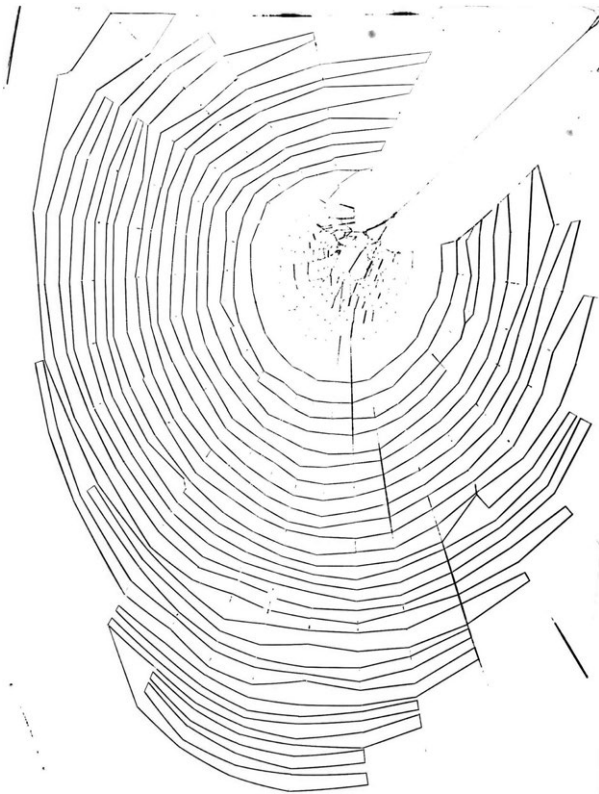
Fig. 1. An example of a web with few anomalies produced by a spider from the same population and reared in identical conditions to those that produce webs with anomalies.