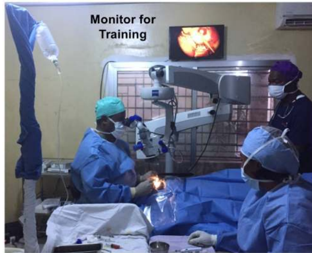
Fig 3. EVICT cataract surgery room setup. Aqueous humor and vitreous procedures were performed with an operator and assistant in full personal protective equipment (PPE). Infectious Diseases specialist monitoring was essential to ensure proper infection prevention and control precautions during the procedure, with specimen handling and during the donning and doffing of PPE. Sierra Leone observers and technical staff in PPE were also present for interpretation and observation of the procedure for training purposes. Following the ocular fluid sampling procedure, once Ebola virus RT-PCR testing of aqueous humor yielded negative results, manual small incision cataract surgery (MSICS) could be performed in surgical PPE as shown. A video monitor was attached to the surgical microscope for additional education and teaching purposes.

https://doi.org/10.1371/journal.pone.0252905.g003