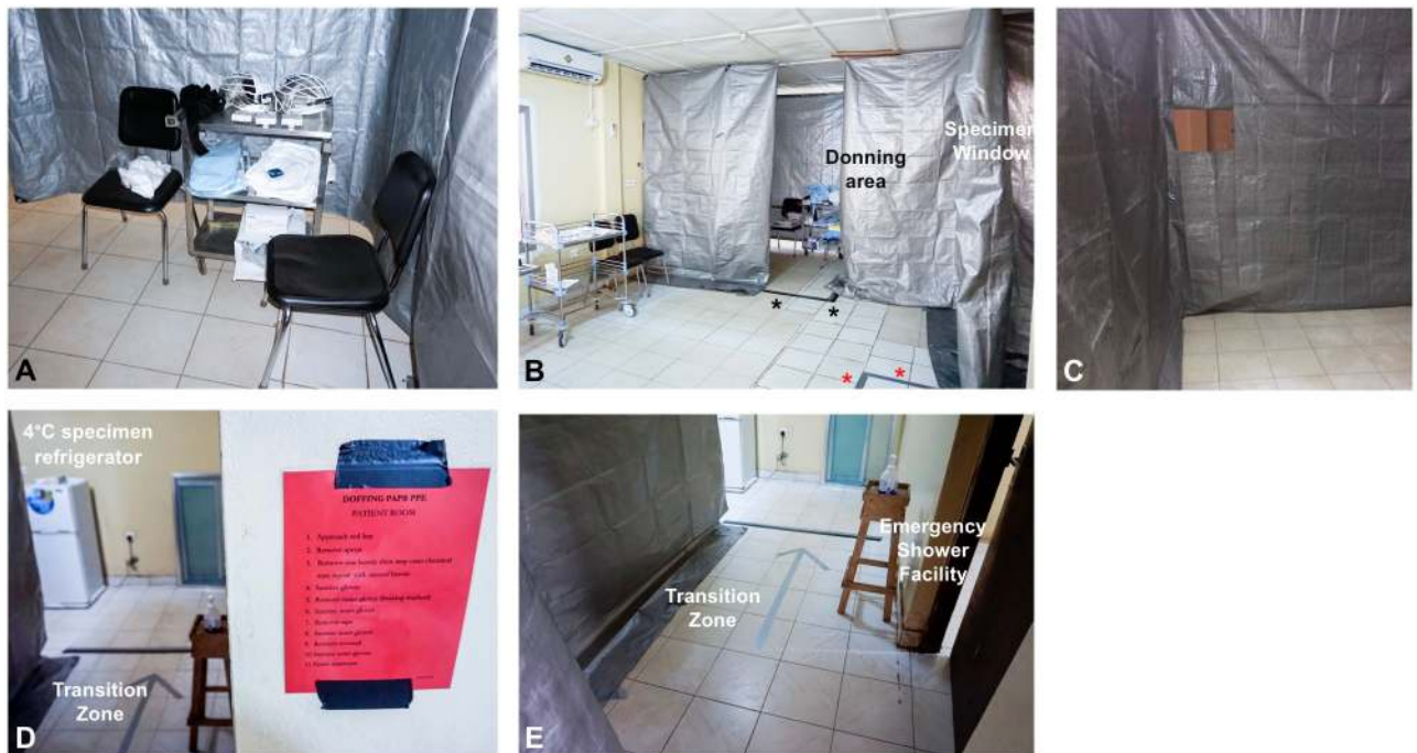
Fig 1. Photograph composite of EVICT study site. The EVICT study site was prepared with input from the Ministry of Health and Sanitation National Eye Programme, Sierra Leone input, along with guidance from Emory Ophthalmology, Infectious Diseases specialists, World Health Organization, and public health officials. A donning station was designed with powered air purifying respirator (PAPR) hoods, fluid impervious Tyvek suits, and shoe covers at the entryway to the procedure room (A). The procedure room created from tarp partitions hooked from the ceiling, contained only the minimum necessary supplies for each ocular fluid sampling procedure with visibility to the donning area, marked by duct tape (B, black asterisks). A specimen window is on the wall of the tarp and duct tape (red asterisks) marks the doffing area for providers to exit via the transition zone. A specimen window is open to a clean area where ocular fluid samples are passed after double-bagging and disinfection of the specimen container (C). Visible signage for doffing is labeled and visible at the transition zone with a duct tape large arrow (D) with access to hand disinfection in the transition zone (E). An emergency shower facility is available in the event of contamination.

https://doi.org/10.1371/journal.pone.0252905.g001