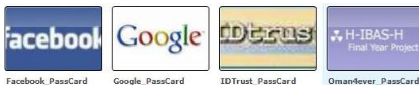
Figure 2: PassCards

Prior to, or during, use of PassCard, the user invokes the CIdS and creates a PassCard, inserting their username in the firstname field and password in the lastname field. Optionally, the user could also insert the URL of the target website in the web page field 9 . For ease of identification, the user can give the PassCard a meaningful name, e.g. of the corresponding website. The user can also upload an image for the PassCard, e.g. containing the logo of the intended site. Example PassCards are shown in Fig. 2.