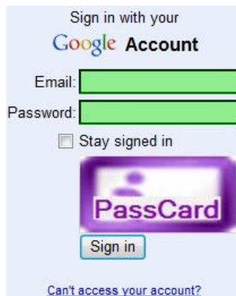
Figure 3: PassCard logo