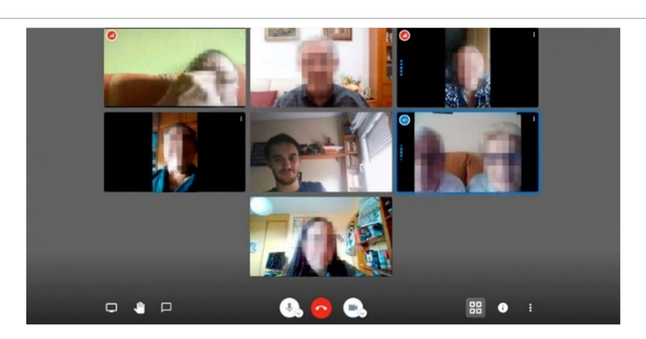
FIGURE 1 | One of the talks on Jitsi with advanced students of information and communication technology (ICT).

Jitsi posed barriers for a few students. The ethnographer shared the call's link on WhatsApp, and since many did not