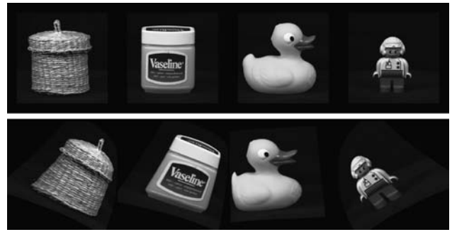
Fig. 3 The original images from the ALOI database ( top ) and their deformed versions ( bottom )

With a standard digital camera (Olympus C-5050), we took a photo of letters printed on a label which was glued to a bottle, see Fig. 4 (left). The letters were organized in a 4 \times 3 mesh with ‘A’s, ‘B’s, ‘V’s and ‘X’s each printed three times in a row. After a simple segmentation, the letters were labeled from left to right A_1, A_2, A_3, B_1, \dots, V_1, \dots, X_1, X_2, and X_3 . Due to the curvature of the bottle surface, the letters appear distorted in the horizontal direction and the distortion grows to the right. A_1 does not exhibit any visible distortion while A_3 is the most distorted one and likewise for