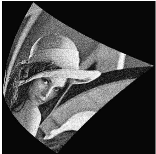
Fig. 1 One of the deformed and noisy images used in the experiment

The aim of the second experiment was to test the discriminative power of the implicit invariants. We took 100 images from the commonly used benchmark database ALOI and deformed each of them by the warping model (17) (see Fig. 3 for some examples). The coefficients of the deformations were generated randomly; q from the interval (-1, 1) and the rotation angle from (-40^\circ, 40^\circ) , both with uniform distribution. Each deformed image was then classified against the undistorted database by two different methods: by implicit invariants according to minimal norm and