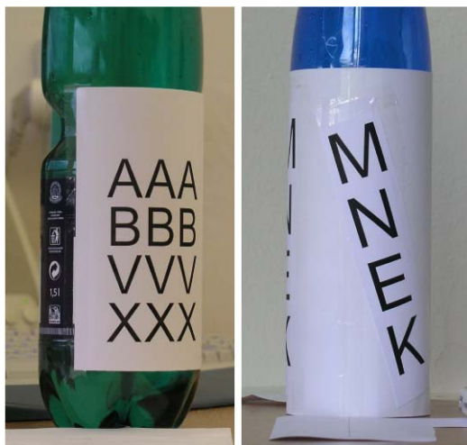
Fig. 4 The bottle images used in the experiment: the letters without rotation ( left ) and with rotation ( right , one sample)

and slight perspective is present. Scaling must be also considered, since the size of the captured letters and database templates may not match.