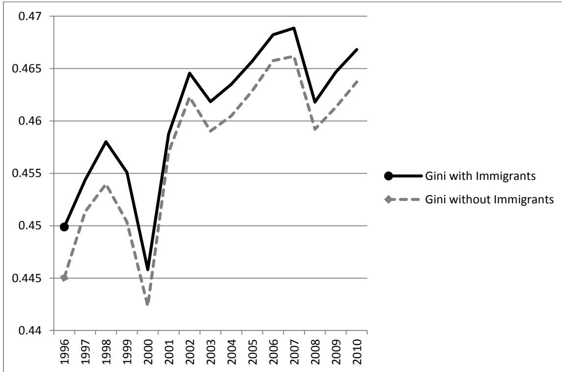
Figure 1: Gini coefficients with and without immigrants in the United States