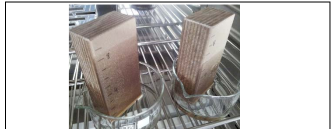
Fig. 1. Experimental setup of capillary tests.

The tests were carried out to compare the capillary action of mineral oil to synthetic ester in the structure of seven different rigid insulation materials. The rigid insulation materials were vertically placed upon the oil samples with the bottoms immersed in the oil, as it is shown in Fig. 1.