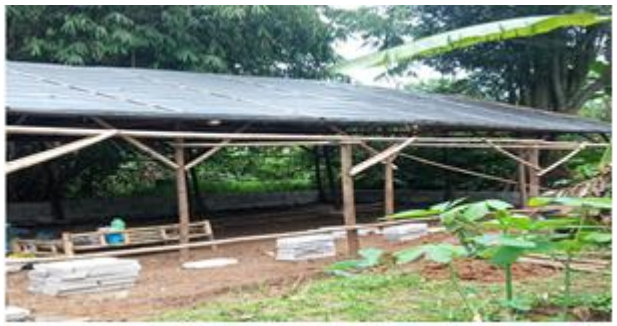
Figure 3. Postal Peking Duck Coop Farming

The size of coop area is 96 m2 which can accommodate 96 x 10 ducks = 960 ducklings up to 96 x 15 duck = 1.440 Peking ducks. To gain efficiently of the materials, this coop is made of bamboo, hebel, and tarpaulin. Peking duck coop was established in Serdang Village RT / RW: 002 /004 with an area of 96 m<sup>2</sup>. This coop is constructed at a distance of approximately 100 meters from the resident area in order to avoid disturbing the surrounding environment. Training for the establishment of a Peking duck coop began on April 4, 2021 and completed on April 17, 2021, the shape of this postal type coop is seen in the following figure.