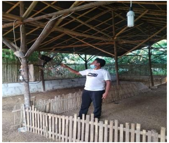
Figure 5. Cooling Fan Installation

Additionally, the installation of a fan is carried out. This fan is "useful for livestock to cool down during the day when the weather is very hot" [13]. The fan installation appears as follows: