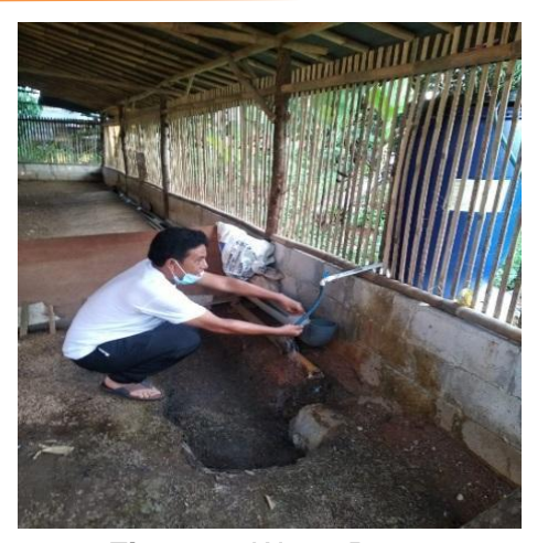
Figure 6. Water Pump

The next job is the finishing of the of Peking duck coops that used coarse bran for approximately 5 (five) sacks and also the installation of feed containers. This coarse bran is stocked throughout the coop land which is useful "to accommodate duck droppings to be easily dried and cleaned, in addition, coarse bran can be used as fertilizer plants" [11]. The following image depicts a duck coop that has been stocked with coarse bran and is already equipped with feed containers.