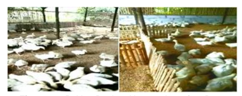
Figure 10. Peking Duck at Harvest Age of 45 Days

Harvesting Peking duck farming can be conducted according to the age of Peking ducks reaches 45 days with an average weight of 2.2 kg to 2.8 kg for each. Here's a picture of a Peking duck at the age of 45 days: