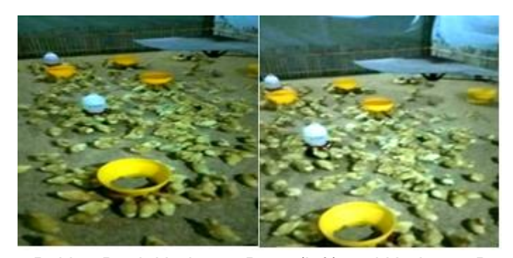
Figure 8. Peking Duck Under 10 Days (left) and Under 15 Days (right)

conducted and resulted in mortality data of 4 (four) ducklings. The cause of mortality is the ducklings were falling upside down and unable to stand on its own. The falls duckling need help to stand, or it will decease otherwise. The Peking ducks of age 1-15 days is called "Day old Duck" [18]. Other interference during the 10-day trial practically was almost not found, as intensive monitoring is conducted. When the weather is hot, the fan should be turned on to reduce the heat of the air on the duck coop. These phases are conducted from April 19, 2021 to April 28, 2021. After led a trial, on April 30, 2021, the PKM Lepisi team will begin Peking duck farming with the Serdang Curug Tangerang villagers. The practice of monitoring the Peking duck during its vulnerable period conducted alternately with the villagers for 10 days, from April 30, 2021 to May 9, 2021. Furthermore, a total of 1.000 ducklings were purchased for Rp 9,000 each, for a total of Rp 9,000,000 (nine million rupiah). Total expenditure for the procurement phase of this duck is amount to Rp 10,000,000 (ten million rupiah), which consists of Rp 1,000,000(expenditure during the trial period) and Rp 9,000,000 (when Peking duck farming began). Here is a picture of Peking ducklings at its vulnerable age in the beginning stage of Peking duck farming.