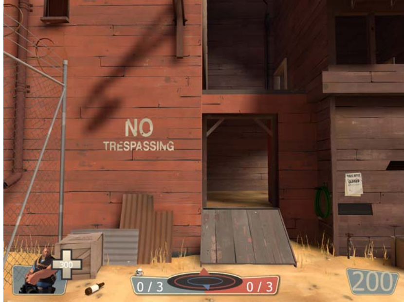
Figure 3. 128×128 “No trespassing” distance image applied to a surface in Team Fortress 2

in order to avoid the costly sorting step, this technique can provide an immediate visual improvement with no performance penalty.