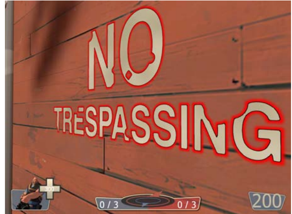
Figure 6. Scary flashing “Outer glow” added by pixel shader