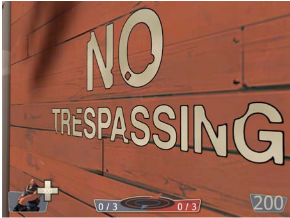
Figure 5. Outline added by pixel shader