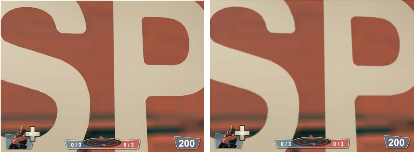
Figure 4. Zoom of 256×256 “No Trespassing” sign with hard (left) and softened edges (right)