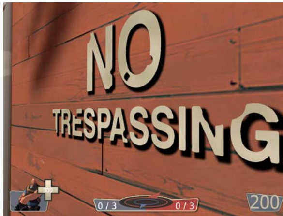
Figure 7. Soft drop-shadow added by the pixel shader. The direction, size, opacity, and color of the shadow are dynamically controllable.