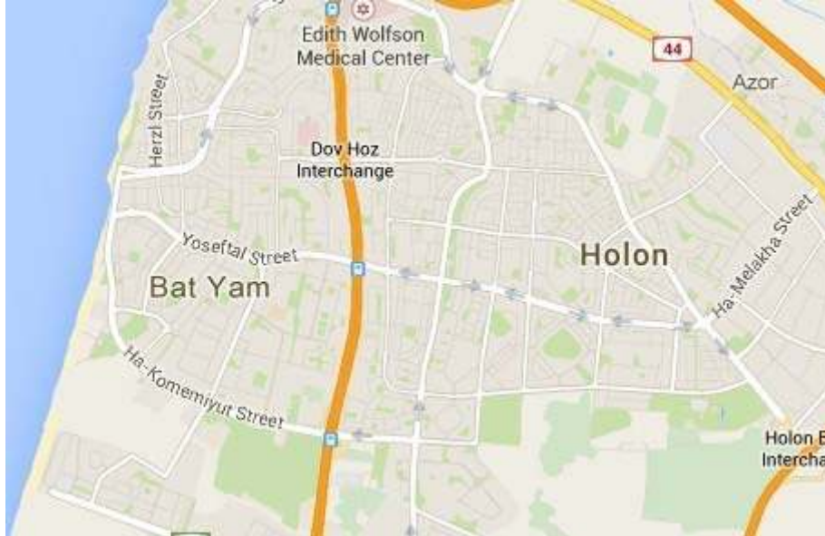
Fig. 2. Example of GPS map.

As can be easily seen the average colors of the beginning of the lines is usually very similar and sometime is even identical. The likelihood for the average colors of the beginning and the end of the lines to be similar is to a great extent lower [11,12]. In particular, the differences between the average colors of the beginning of the lines in Figure 3 for Y, U and V are all zero i.e. they are totally identical. The DC values of Y, U, V in the end of line 2 are 237, 125, 127, accordingly the differences between the average colors of the end of the lines in Figure 3 for Y is 1, for V is 3 and for V is also 3. In view of the fact that the DC values are stored as the differences between the current value and the previous value, we should focus on the differences. When there is no difference, according to [13], it will be indicated by JPEG by the sequence 00 which is a two bits string; however, 32 will be indicated by the string 1110100000 and 34 will be indicated by 1110100010 which are both 10 bits strings.