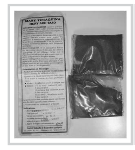
Fig. 2 "Totaquina": powdered bark of Cin chona ledgeriana sold as a phytomedicine in Madagascar (reproduced by the author).

Herbal infusions (according to the Anamed recipe) are the preparation most widely tested in Africa, in six trials. These report rates of parasite clearance ranging from 70% to 100%, with recrudescence rates up to 39% [24] ( • Table 2). The only side-effect reported was nausea in 3–25% of patients. However, none of these studies included children, who are the group at greatest risk of severe malaria and death. A recent pilot pharmacovigilance study