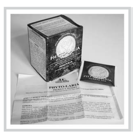
Fig. 3 "Phyto-laria": a standardized teabag formulation of Cryptole-pis sanguinolenta on sale in Ghana (reproduced by the author).

Development and use of the phytomedicine: Cryptolepis sanguinolenta (Lindl.) Schltr. (Apocynaceae) is a scrambling shrub native to West Africa and used for the treatment of malaria in Ghana and in the Democratic Republic of Congo [42,43]. In 1974, C. sanguinolenta was introduced to the Centre for Scientific Research into Plant Medicine (CSRIPM) in Mampong-Akwapim, Ghana. Decoctions of the roots of this plant have since then been used to treat malaria and some bacterial infections [44]. It has been developed and sold in standardized teabags under the brand name of "Phyto-laria" by the company Phyto-Riker (• Fig. 3) and is approved by Ghana's drug regulatory agency, the Food and Drugs Board [45]. Each teabag contains 2.5 g of