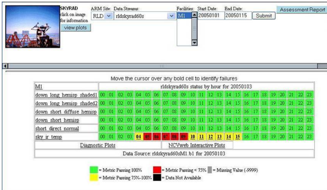
Figure 1. RLD skyrad60s on January 3, 2005.