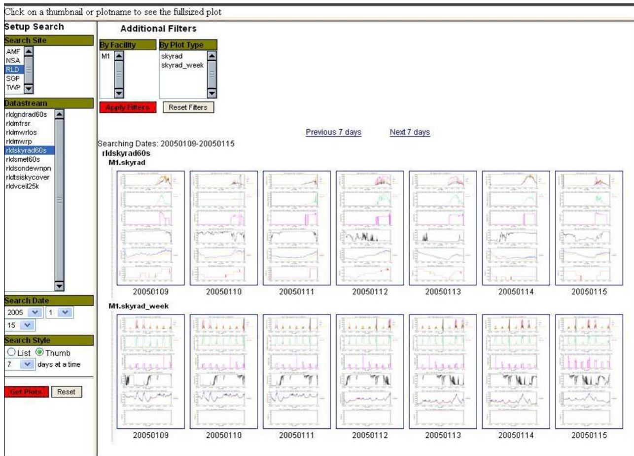
Figure 4. Thumbnail plots available.