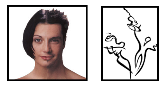
Figure 1. Two inherently different images that share the same ESP labels: "man" and "woman." The Phetch descriptions, however, are different: "half-man half-woman with black hair" and "an abstract line drawing of a man with a violin and a woman with a flute."

One possible approach to assigning descriptions to images in order to improve accessibility is the ESP Game, which allows people to label images while enjoying themselves [1]. The game collects random images from the Web and outputs keyword labels that describe the contents of the images. For example, for an image of a cat and a dog, the ESP Game outputs "cat," "dog," "animals," etc. If all images on the Web were labeled by the ESP Game, screen readers could use these keywords to point out the main features of an image. This, however, can be vastly improved. While keyword labels are perfect for certain applications such as image search, they may be insufficient for describing the contents of a picture. This is demonstrated in Figure 1. We therefore design a different game that collects sentences instead of keyword descriptions. We further show below that the descriptions collected using our game are significantly more expressive than the keywords collected using the ESP Game.