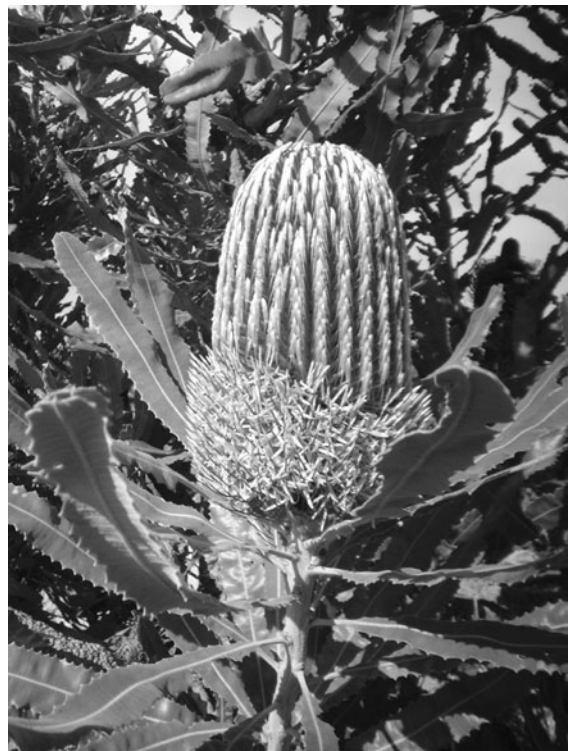
Fig. 1 Iconic Banksia menziesii invoke a sense of place in Perth, Western Australia

More generally, the high species diversity evident in urban landscapes owes a great deal to the varied management decisions of its household gardeners (Gaston et al. 2005; Grimm et al. 2008). Indeed, gardens reveal a diversity of preferences for nature, which are often driven by socio-economic status (Hope et al. 2003; Pedlowski et al. 2003) or cultural norms (Head et al. 2004). Modern multi-cultural cities are likely to include a wide variety of gardens and gardeners. So rather than prescribing management options for gardens, we can probably assume that some people will choose to plant native species in their gardens while others will choose non-native species. Choosing native species may be part of a civic effort to reduce water use whereas non-native species may be selected to grow food in community gardens. Collectively, this gardening effort will result in a wide variety of opportunities for city folk to interact with nature.