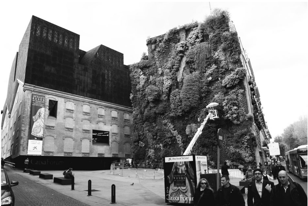
Fig. 2 Living wall in the city of Madrid, Spain.

We live in a world where most people live in cities and novel ecosystems outnumber wildlands. We do not mean to suggest abandoning the traditional practice of biodiversity conservation, but at the same time, we agree with other authors who have suggested other