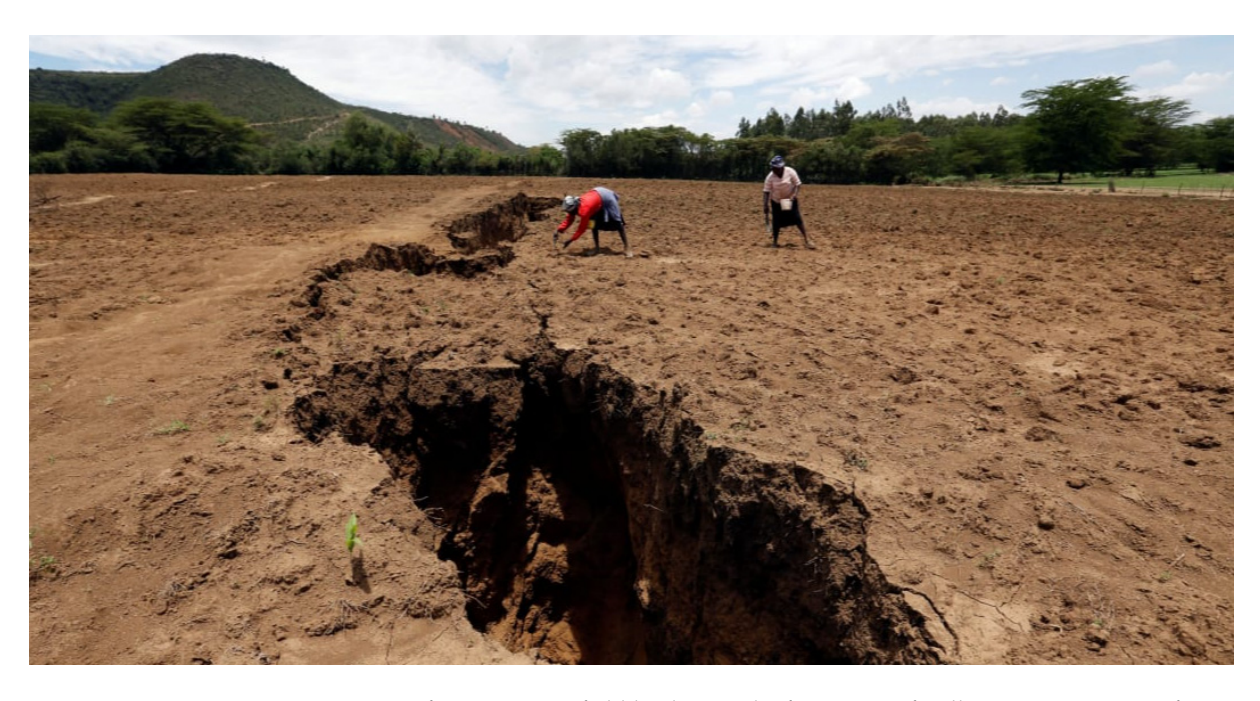
Figure 2. A rift in a Kenyan field leading to the formation of gullies.

The use of herbicide-tolerant GM crops such as roundup ready maize and soybean comes with indirect environmental benefits by enabling no-till/zero-till farming [30]. This has the potential advantage of stabilizing the soil profile as well as maintaining the soil structure in erosion sensitive areas of SSA, for instance the East African Rift region where gully erosion is rampant [31].