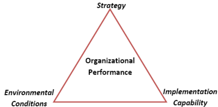
Figure 1. Aligning Determinants of Organizational Performance