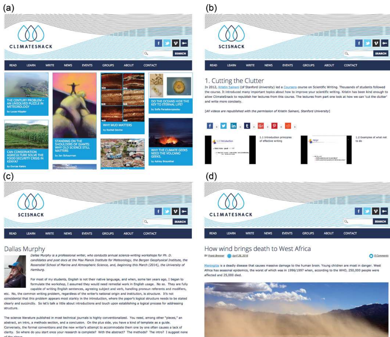
Figure 3. Screenshots from the ClimateSnack/SciSnack website showing (a) the home page, (b) one of the chapters from the online writing course from Kristin Sainani, Stanford University, (c) expert advice from author Dallas Murphy, and (d) an example snack.