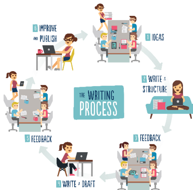
Figure 1. The ClimateSnack writing process.

The ClimateSnack founders designed a writing process, which is still used as a guide for writing-group meetings. ClimateSnack participants write short texts about their own research or a scientific topic of interest. These texts were dubbed as “snacks” and are usually 400 to 700 words long. Snacks are meant as snapshots of the authors' interests rather than full-length texts suitable for peer-reviewed journals. The snacks develop from an initial writing idea to a finished prod-