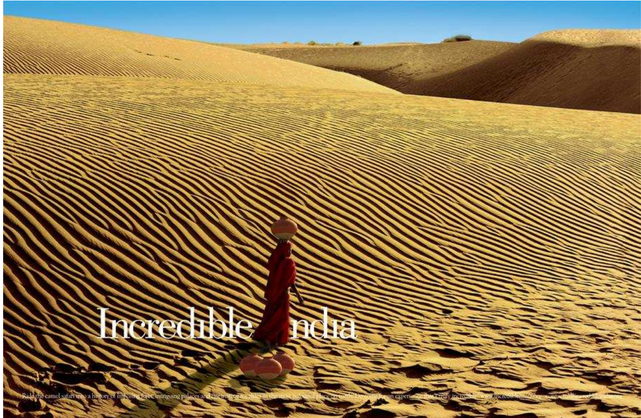
Figure 1. 'Ride the Camel Safari', An experience that's truly incredible, 2002/03 Campaign