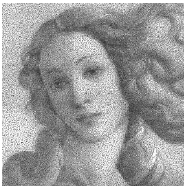
Botticelli's The Birth of Venus as a 140,000-city TSP. The cities are placed in proportion to the various shades of gray in the original image.