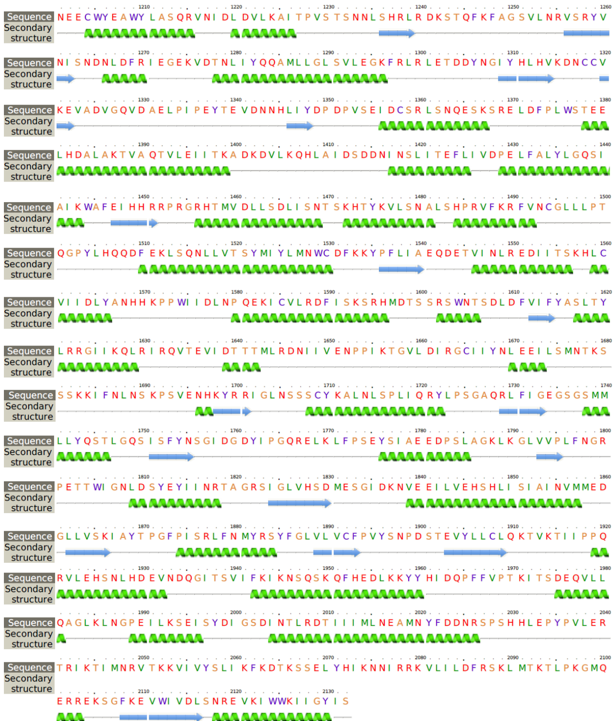
Figure S4. Secondary structure distribution of the full L protein as predicted by Phyre2 server (Kelley et al., 2015).