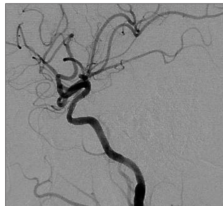
Fig. 4. After angioplasty of the stenotic segment, there is a marked improvement in the caliber of the lumen with improved flow throughout the internal carotid artery.