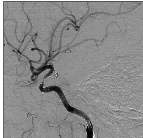
Fig. 3. Left internal carotid artery angiogram obtained 9 months later demonstrating diffuse stenosis throughout the stented segment of the internal carotid artery, most severely within the mid-portion of the stent.