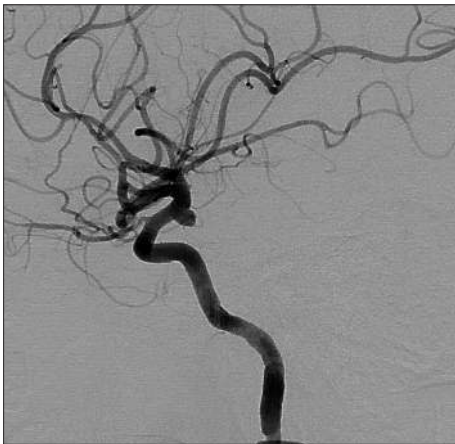
Fig. 1. Left internal carotid artery angiogram depicting a broad-based aneurysm arising from the posterior wall of the left internal carotid artery.

After 9 months, we routinely performed a follow-up DSA. Although still experiencing persistent headache, she indicated no new neurologic complaints, and her neurologic examination was normal at that time. A DSA confirmed diffuse stenosis throughout the stented segment of the ICA, most severely within the mid-portion of the stent. A stenosis rate was measured approximately more than 90% (Fig. 3). Collateral circulation was provided mainly by the right ICA through the anterior communicating artery.