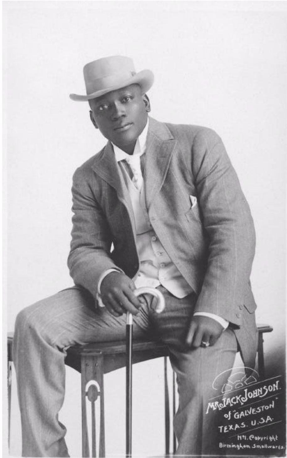
Fig 1 Dapper Jack Johnson wearing his beige tweed suit, 1908. NAA A1861, 848 'Boxer Jack Johnson of Galveston, Texas'.