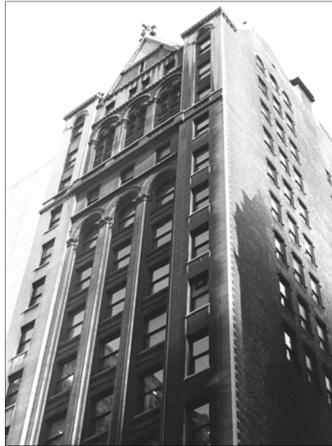
A view of Fordham University School of Law’s final downtown location at 302 Broadway.

preceding president of the ABA, wrote a letter to the dean, stating: “At a time when so many teachers of law have gone ‘haywire’ in impromptu acceptance of this awkward and alarming method of accomplishing needed progress in legal doctrine, it is gratifying and reassuring to find that the faculty of a fine law school is unanimously in well-considered opposition.” 313