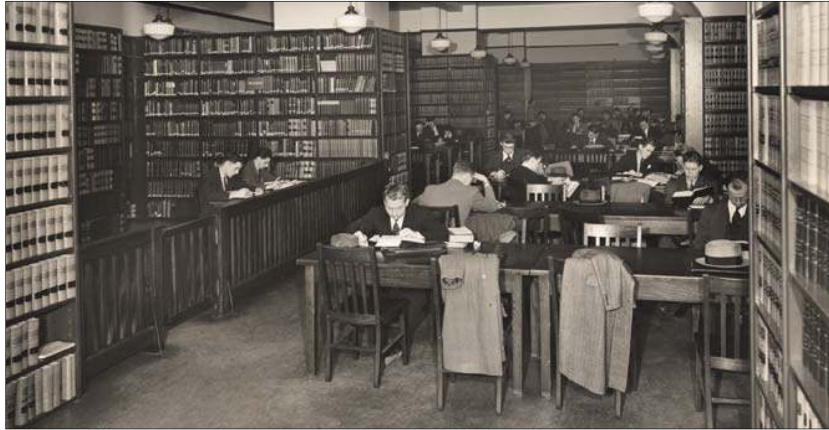
Students study at the law library located on the twenty-eighth floor of the Woolworth Building.

American students, 214 and increasing the student body to over 1,400 students. 215