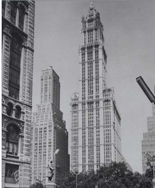
A view of the Woolworth Building, which housed Fordham University School of Law from 1915 until 1945.