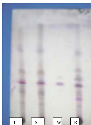
Plate 2: TLC fingerprint of samples T-tissue cultured plants, S- seed raised plants, W-standard withaferin A and R- root extract of W. somnifera