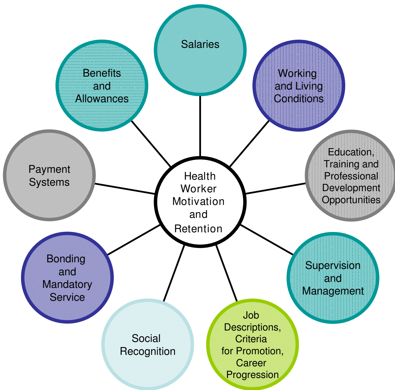
Figure 3 Factors affecting health worker motivation and retention.