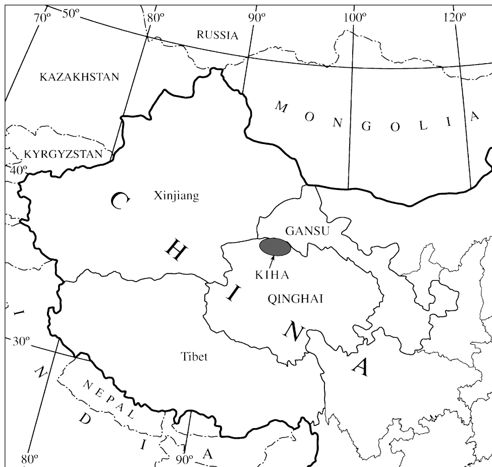
Fig. 1 Location of the Kharteng International Hunting Area (KIHA), Aksai County, Gansu Province, China. Although administered by Gansu, KIHA is located within Qinghai Province as displayed on most maps.

We conducted a preliminary survey of argali distribution and initial interviews with Aksai staff during August 1997. While attempting to capture argali for radio-marking, we conducted additional informal surveys and