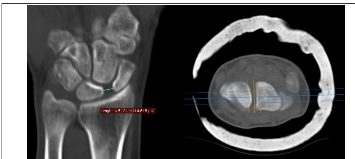
Fig. (1). Measurement of the scapholunate interval in the coronal plane

After ethics committee approval, we retrospectively evaluated all distal radius fractures ( n=391 ) from 2007 to 2015 that were treated in the British Hospital of Montevideo, Uruguay. These were identified through an ongoing procedure database kept by the traumatology department, that collects patient and treatment data prospectively. Patients with a non-anatomic fracture position were operatively treated using a volar approach with volar variable angle plate. The scapholunate joint was not surgically treated in any patient. All patients underwent a postoperative Computer Tomography (CT) scan. We excluded one patient with a bilateral distal radius fracture that had a SLD of one of the fractured sides. Patients ( n=14 ) with a scapholunate interval (SLI) of \geq 3\text{mm} in the injured wrist underwent a CT scan of the contralateral wrist. Of these patients 8 (57%) had a contralateral SLI that was \geq 3\text{mm} . We included 2 males and 4 females, with a median age of 61 (54-87) years with an average radiographic follow-up of 109\pm 91 weeks and average functional follow-up of 136\pm 90 weeks. One patient had a conventional radiograph at final follow-up, all other patients had a CT scan. There were 3 type C3 fractures, 1 type C1 fracture, 1 type B2 fracture and 1 type A2 fracture. There was an associated ulna fracture in 2 patients.