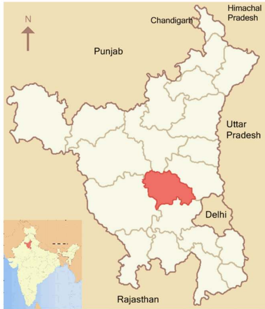
Figure 1. Showing geographic location of Rohtak district in North India